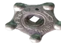
Co2 Wheel egg shape