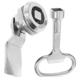
Hose box lock in ss