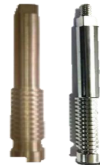
Spindle rod in ss / brass