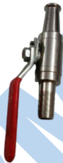
In ss 20mm