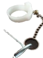
Co2 Lock pin in chain