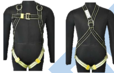
Full body harness