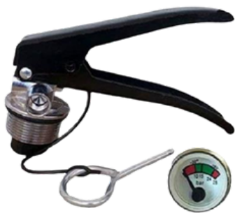
ABC Valve + Gauge set