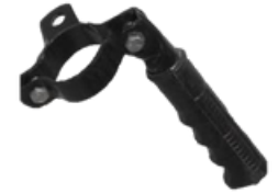
Co2 Body handle