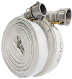
Hose reel connecting pipe