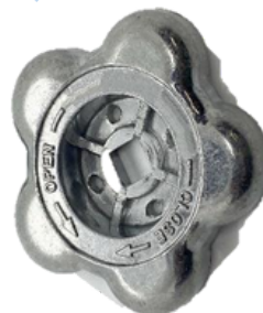
Co2 Wheel in square