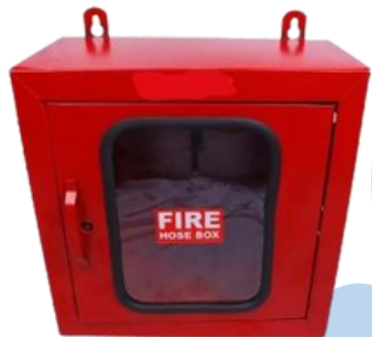
Fire extinguisher cabinet