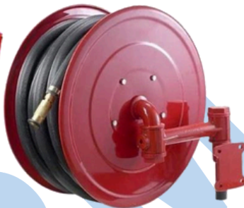
Hose reel drum