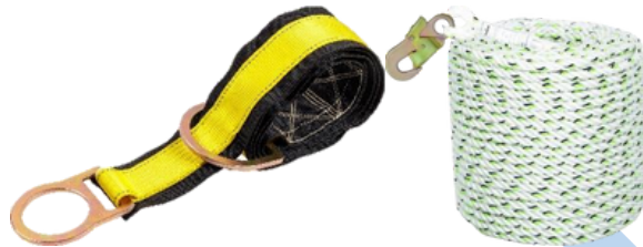
Lanyards and anchorages