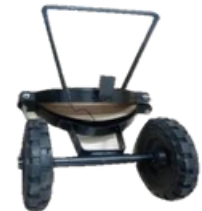
Co2 Trolley 6.5kg, 9kg, 22.5kg