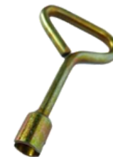
Hose box key