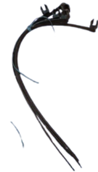
Fire safety belt