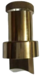
In brass Lugs