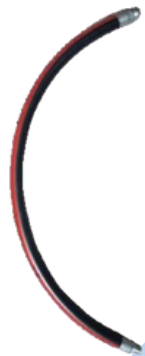
Sease fire hose 10kg