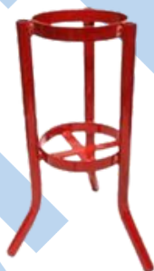
ABC Floor stand