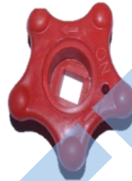
Co2 Wheel in plastic