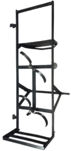
Stand for 3 extinguishers, 2 (9kg), 1abc