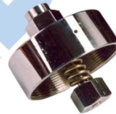
Brass Forging cap