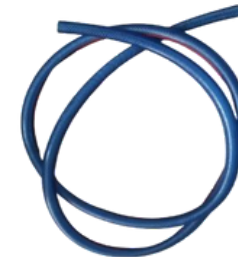
5mtr. & 3mtr.