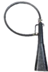
Co2 Hose +Horn