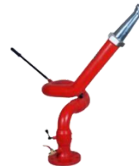
Fire water monitor