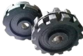
Trolley wheel AFF