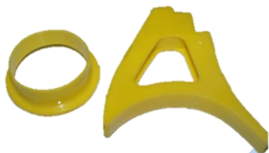
ABC Safety + Neck ring