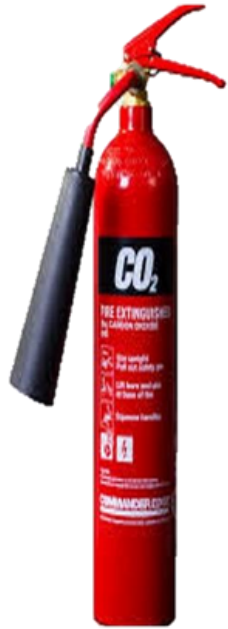
Co2 in 2kg, 3kg, 4.5kg