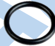
Valve o ring