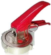
Squeeze grip valve