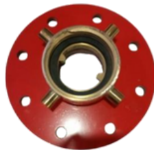
C.I. draw out connection