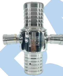
SS Male Female coupling