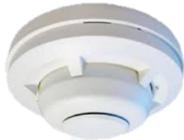
Smoke detector with RLY