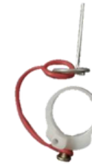
Co2 lock pin in plastic